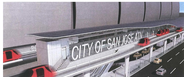
Rendering by Arup International

For example, to capture the imagination of local industry to participate in this emerging marketplace, the Transportation Department staff at the City of San José coined the term ATN (Automated Transportation Network). Opportunities to supply the "A" in ATN means new markets for Silicon Valley companies established in electronics, software, control systems, networks, power electronics, sensors, etc.